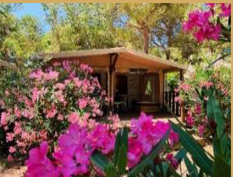
MINI LODGE TENT - ca. 14 Sqm - 1/2 ppl.

The Mini Lodge Tent is a tent composed only of a modern and functional double bedroom with a mini-fridge and a beautiful sky view, thanks to the windows,